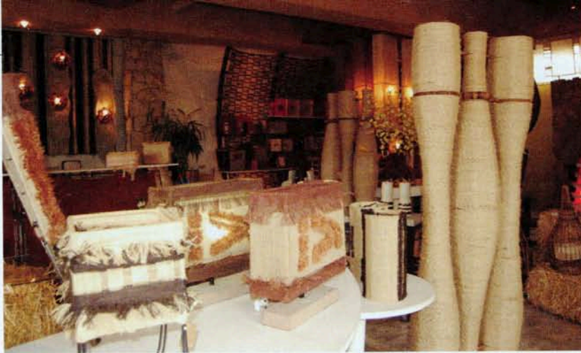
This photo: Upscale home decor store in Nairobi. Opposite page: Visiting a giraffe center in Kenya.