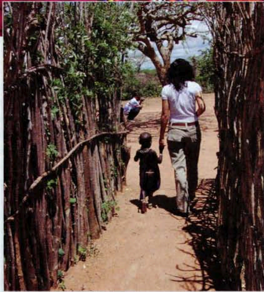
Both photos: Maasai women and entering a Maasai village.

capped peaks in Africa, and the second highest mountain on the continent; clients stay at the exclusive Serena Mountain Lodge . This "treetops" hotel is designed to allow guests a bird's-eye view of animals as they wind down the mountain slopes to the nearby watering hole. From there, riders descend into Samburu's hot, arid desert. Here, the animals concentrate at the sparse watering holes and clients will have the opportunity to see a very different part of the wildlife spectrum. They then head south back to Nairobi to do some souvenir shopping or simply relax in the exclusive Kensington Nairobi lounge and bar.