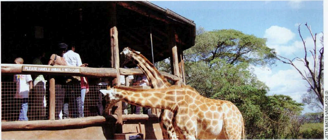
JETTA BATES-VASILATOS (2)

past the flamingos of Lake Nakuru, to Lake Naivasha. Famous for its hippos, riders can use the opportunity to rest and relax or take a boat trip to Crescent Island and hike amongst the wildlife. The riding day in the Rift Valley is a real highlight. Hell's Gate is known for its geothermal steam and Mount Longonot is an extinct volcano with spectacular vistas. Clients will ride through herds of zebra and giraffe while honing their skills on gravel and dirt. After that, they continue on to Mara on roads that deteriorate from pavement to gravel to pure off road where they'll explore the private reserves north of the Mara where game is at times even more abundant. The expert guide will take riders up the Nguruman Escarpment and through the surrounding hills to get the best sightings.