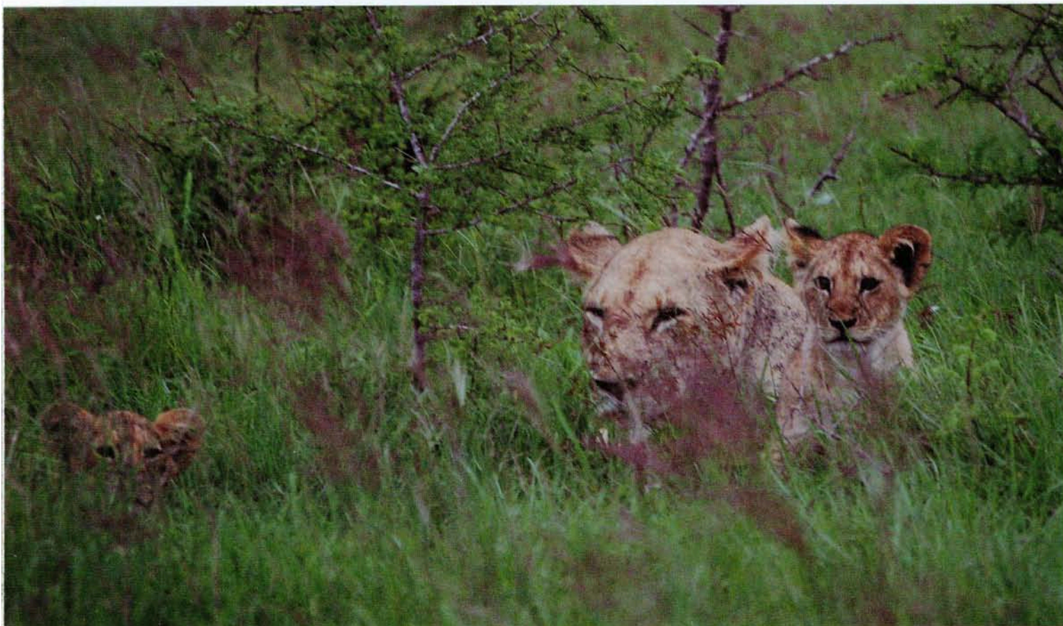
JETTA BATES-VASILATOS (3)

One of the most captivating experiences of a trip to this African nation is the opportunity for game viewing at every turn.