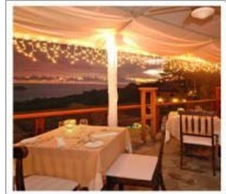
Hotel Si Como No Dining