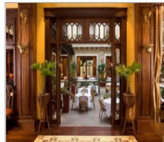
Grano de Oro, San Jose