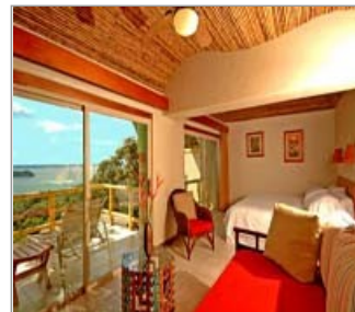
Hotel Si Como No Guest Room

STANDARD ROOMS (A/C) Jungle view, bath with shower, wet bar, stocked mini-bar, 2 queen sized beds, A/C, ceiling fans, telephone and security box. Max 4 pax. SUPERIOR ROOMS (A/C) Partial ocean and jungle view balconies, bath with shower, wet bar, stocked mini-bar, king or queen size beds, A/C, ceiling fans, telephone and security box. Max 4 pax. DELUXE ROOMS (A/C) Panoramic ocean and jungle view balconies, high beam ceiling, bath with shower, wet-bar, stocked mini-bar, king size beds, sitting room or extra bed, A/C, ceiling fans, telephone and security box. Max 4 pax. DELUXE SUITES (A/C) Spacious double size room with large balcony, sitting area with sofa bed and large bathroom with full amenities overlooking