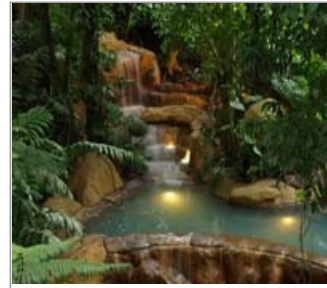
Hot springs at The Springs Resort & Spa