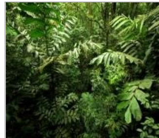
Cloudforest Reserve Tour