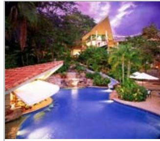
Hotel Si Como No, Manuel Antonio

It's the "everything-you-need-to-KNOW-to-really -SEE-Como No" page. Every activity you can do. Every tour you can take. Brought to you by the attentive Si Como No Excursion Department! And all just a mouseclick away. To save you the time of having to surf the web in search of all the great activities waiting for you in Costa Rica, we've put together the most exciting excursion options. It's all right here -- nature walks, snorkling, aerial trams, canopy zip lines, gourmet food, deserted islands, catamarans, world-class sportfishing and much, much more. For less! Spa SURRENDER TO SERENITY Relax. You're in good hands. Very good hands. Our Serenity Spa therapists offer a full range of treatments using a blend of natural, organic Costa Rican products and high quality, corrective skin and body care products. After a day of adventure there's nothing like a visit to our Serenity Spa.