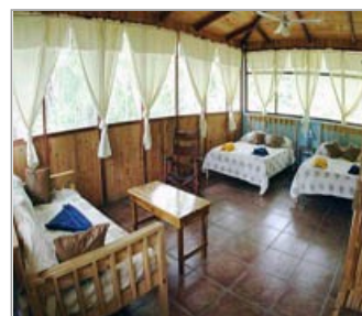
Room at Turtle Beach Lodge

Nature shows its true colors at the Turtle Beach Lodge in the Tortuguero region of Costa Rica. Here, the jungle envelops the lodge, which can fit up to 80 people in its standard, deluxe, and honeymoon rooms. The lack of distractions from modern technology such as televisions and phones ensures a soothing ambiance. The chef cooks up a storm, with unthinkable mélanges of vegetables, fruits, and meats, all served under a thatched roof. One may find themselves picking things off the trees and plants in the jungle, as well. Well-informed guides are ready to share their expertise and are adventurous, so prepare for some knowledge and fun. (NOTE: All of the activities and transportation in Tortuguero will be shared with other travelers.