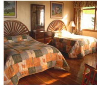
Room at Hotel Fondavela, Monteverde

The Monteverde Cloud Forest Reserve is a private biological reserve dedicated to the conservation of the rare flora and fauna of this unique ecosystem. The reserve is 26,000 acres and is an important link in the growing network of protected areas in Costa Rica. It attracts birdwatchers from around the world. All entrance fees go to maintenance of this rare cloud forest reserve. Hotel Fonda Vela is one of the closest hotels to the Reserve. Visit the Santa Elena Cloud Forest Reserve. The flora and fauna are similar to the more famous Monteverde Reserve. This reserve is located 12 km away from Hotel Fonda Vela. On clear days, there are beautiful views of Volcano Arenal. All entrance fees collected go to the improvement of regional education. Try some Canopy Thrills. Ziplines, attached from one mountain top platform to another, allow you to glide through the forest canopy with the use of special equipment.