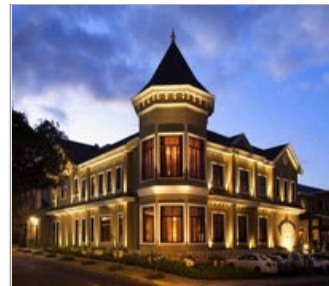
Grano de Oro, San Jose

Guests delight in the tranquil ambiance of tropical plants and flowers found throughout the hotel. Additionally, a rooftop garden terrace with lawn beds and Jacuzzi provides blissful, secluded lounging. The Gallery gift shop displaying quality Costa Rican handicrafts is the perfect place to browse for that special souvenir of Costa Rica.