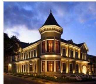
Grano de Oro, San Jose