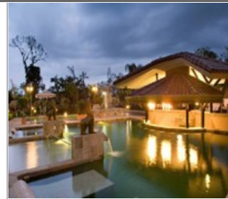
Pool at Hotel Royal Corin Resort & Loto Spa

The Lotto Spa Rest and relax, you visit us for that. This is the reason of being of the Lotto Spa, where visitors will be able to enjoy true relaxation moments and rest to alleviate the stress and the accumulated tensions. Our personnel, highly qualified, will offer you an excellent service that will help you to forget the routine and the complications of the daily chore. Discover the wonderful experience of receiving a massage of professional hands, in a totally different place and with the attention that you deserve. After your treatment, the relaxation areas will allow you to enjoy the sauna, the jacuzzis or the pleasant thermal waters. If you prefer you can stay in our massages rooms and to enjoy a drink in the comfort of the private jacuzzi of them. Tours The hotel offers you a number of additional adventures to make your stay more exciting and enjoyable. Our hosts could have from a refreshing journey in a boat with no engine, or an exciting fall with ropes by rocky walls