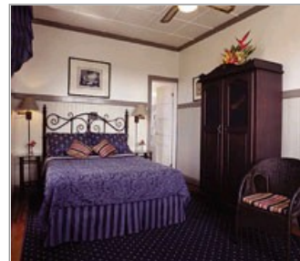
Grano de Oro, San Jose