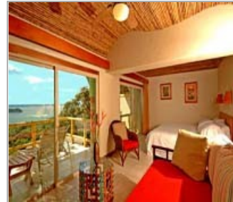
Hotel Si Como No Guest Room