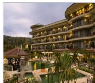
Hotel Royal Corin Resort & Loto Spa