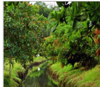
Canal, Turtle Beach Lodge