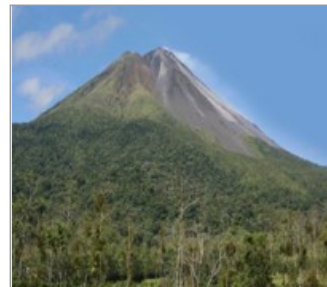
View from Hotel Royal Corin Resort & Loto Spa