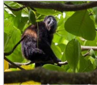
Canal Tour Animal Sightseeing