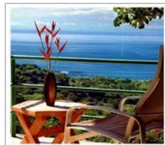
View at Hotel Si Como No