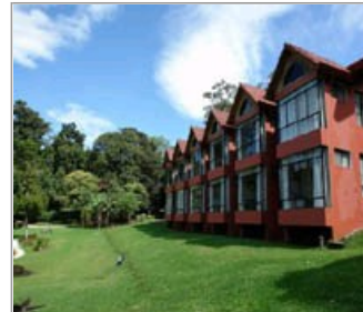
Hotel Fondavela, Monteverde