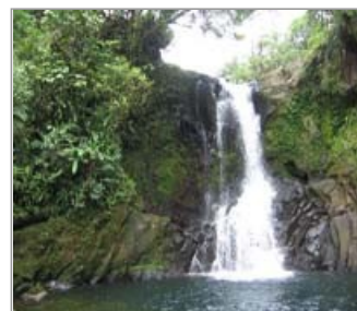
The Waterfall at Braulio Carrillo