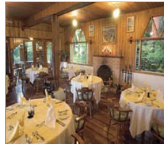
Dining at Hotel Fondavela, Monteverde