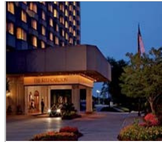
The Ritz-Carlton, Buckhead - main

Just 75 minutes east of Atlanta International Airport on Georgia's Lake Oconee, the stunning Ritz-Carlton Lodge, Reynolds Plantation draws on local history and culture as the foundation of the guest experience. Set against the shimmering blue backdrop of Lake Oconee, the Lodge offers luxurious accommodations and 81 holes of golf along the pristine coast. The 26,000 square foot spa, recently ranked one of the top 5 spas in North America by Travel + Leisure magazine, rejuvenates guests with southern-inspired service and treatments, and the lake itself offers many exceptional activities and diversions.