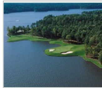
Ritz Carlton Plantation