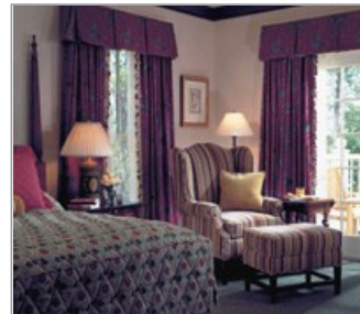
Ritz Carlton Plantation