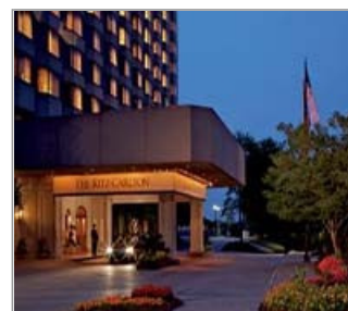
The Ritz-Carlton, Buckhead - main