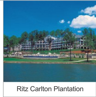
Ritz Carlton Plantation

Just 75 minutes east of Atlanta International Airport on Georgia's Lake Oconee, the stunning Ritz-Carlton Lodge, Reynolds Plantation draws on local history and culture as the foundation of the guest experience. Set against the shimmering blue backdrop of Lake Oconee, the Lodge offers luxurious accommodations and 81 holes of golf along the pristine coast. The 26,000 square foot spa, recently ranked one of the top 5 spas in North America by Travel + Leisure magazine, rejuvenates guests with southern-inspired service and treatments, and the lake itself offers many exceptional activities and diversions.