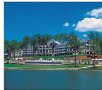
Ritz Carlton Plantation