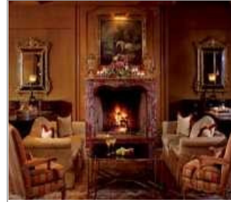
The Ritz-Carlton, Buckhead