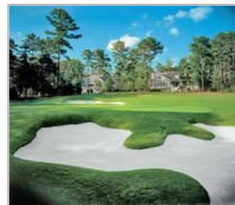
Morning at Leisure

Depending upon course availability, this afternoon you will have the opportunity to play 18 holes on one of the five Reynolds's Plantation courses: Reynold's Landing, is the original golf course on Lake Oconee and is centered on a classic Bob Cupp golf course that earned numerous awards when it opened in 1986. The National Course, designed by Tom Fazio is the third gem at Reynolds Plantation. Boasting 27-holes, the National features impressive elevations, wonderful views and several holes skirting the shores of Lake Oconee. The Oconee Course, the Rees Jones-designed resort course, presents a golfing challenge unmatched by any other in the nation. Described by many as "mind-game golf," the new Jones addition to the Reynolds Plantation landscape is designed to be a true risk/reward challenge. Great Waters, an 18-hole Jack Nicklaus-signature design, winds through densely wooded evergreen corridors only to open up to nine holes featuring the blue waters of Lake Oconee as the rough. Named as one of the best courses in Georgia, second only to Augusta National, Great Waters is one of the most aesthetically inspiring golf courses in the continental United States. The Plantation Course has been ranked among the "Ten Best New Courses." and is characterized by a natural, rolling layout that possesses innumerable subtleties. The hills are natural to the terrain, but the funny lies and bounces result from the ingenuity of shaping during construction."