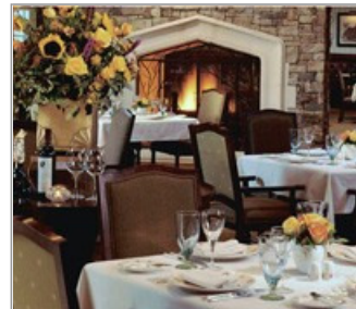
Ritz Carlton Plantation