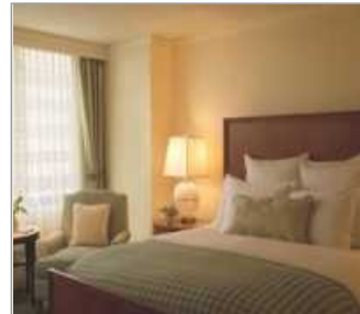
The Ritz-Carlton, Buckhead