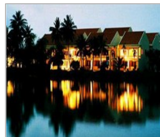
Life Resort, Hoi An