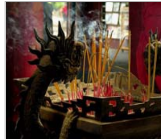
Dragon & Incense sticks in Temple of Literature