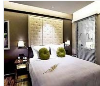
Moevenpick Hotel Hanoi Room