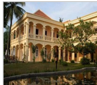
Life Resort, Hoi An

Senses Restaurant As Hoi An is a melting-pot of cultures, the Senses Restaurant captures the essence of both eastern and western influences and blends these with the exotic flavors of Vietnam's local cuisine. This fine dining, open-air restaurant serves our unique "Life Cuisine". Sample the simple and fresh, the creative and often times daring fusions of our executive chef. Cafe Vienna Merchants from the far continent of Europe also frequented Hoi An. Recognizing its rich trading potential, merchants crossed the seas and docked in this ancient town as early as in the 15th century. Spanning four centuries, the French and Austrian influences are now evident in the town's architecture, interior designs, landscapes and culinary specialties. Café Vienna serves a wide selection of coffee, tea and delicious pastries as well as Austrian delicacies in a traditional Viennese style and atmosphere.