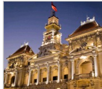
Ho Chi Minh City

Located in the heart of Saigon's business district, the Renaissance Riverside Hotel Saigon offers first-class hospitality, comfortable rooms and modern amenities. After a long day, relax at the poolside terrace or enjoy a leisurely dinner at Kabin, known as one of the finest Chinese restaurants in the city. Take a dip in the rooftop pool and visit the Health Club for an invigorating workout with the latest gym equipment. Otherwise, simply enjoy the incredible views of the Saigon River and stroll to museums, galleries and other area attractions. You'll find that the hotel's central location, panoramic views and impeccable service makes this the ideal place to stay while visiting Ho Chi Minh City.