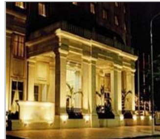
Moevenpick Hotel Hanoi