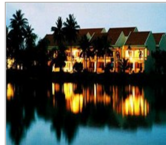
Life Resort, Hoi An

Life Resort Hoi An is a tranquil getaway tucked into the French colonial town, Hoi An, a UNESCO World Heritage Site. The 94 rooms are offered as junior suites, superior rooms, and grand suites. Each is set with high standard fabrics and furnishings, using contemporary decor. Subtle delights mark this deluxe resort experience, known for genuinely hospitable staff. Dine at Senses Restaurant, which is host to the mouthwatering flavors of Vietnam, or Cafe Vienna, the European-style hotel hangout. Later, take a bicycle trip through the town and countryside or a ferry ride to the beach.