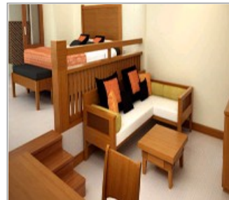
Life Resort, Hoi An

Superior room Overlooking our beautifully landscaped gardens, the superior rooms offer queen and twin size beds, with a private porch ( 39 sqm with 6 sqm private porch) Junior suites Choice of garden and river-view, queen and twin-size beds, shower or sunken bathtub, a comfortable sofa bed and a private porch. Some rooms are available with connecting doors (42 sqm with 8 sqm private porch). Grand Suites Choice of garden and river-view, all Grand suites are furnished with queen-size bed with both shower and sunken bathtub, spacious living room with large sofa bed, a DVD player and a private porch (84 sqm with 8 sqm private porch).