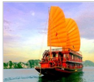
Halong Ginger Junk

While the view is undoubtedly the best feature of each of the ten guest cabins, guests will also appreciate the rooms' tasteful décor and