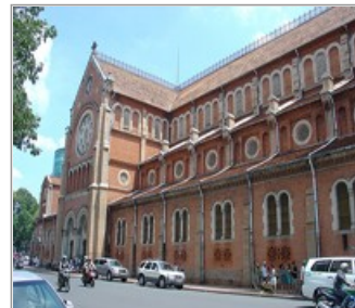
Notre Dame Cathedral, Ho Chi Minh City, Vietnam