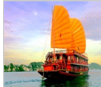
Halong Ginger Junk