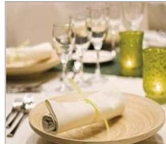
Moevenpick Hotel Hanoi Restaurant